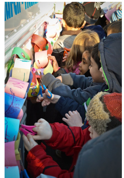
Falls Church-McLean Children's Center preschoolers cutting the construction-paper chain.