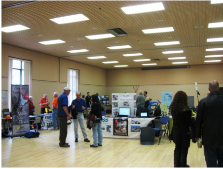
Attendees browse the numerous informative exposition booths at the 2012 Be Fit Expo.