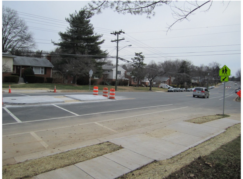
Construction is still underway for a new pedestrian median, curb ramps and crosswalk at Bonheim Court and Westmoreland Street.

Other projects underway to improve safety along Westmoreland Street include: